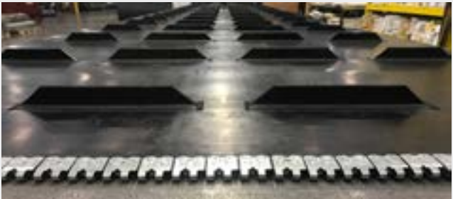
Cleat Cut Outs and Dog Ears